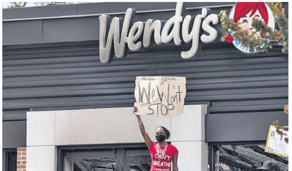
People hold a rally at Wendy's on University Avenue in Atlanta on Sunday, June 14, 2020.